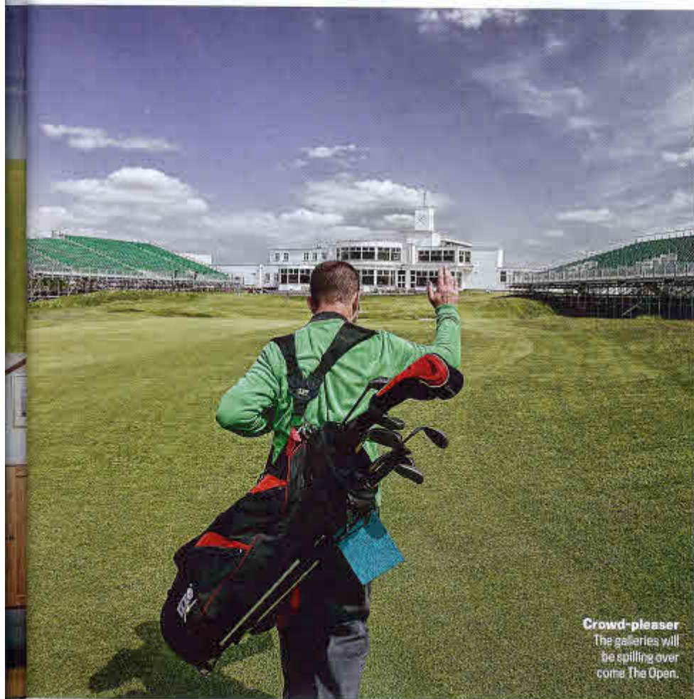
Crowd-pleaser The galleries will be spilling over come The Open.

risk and reward." There will be a lot more thumbs down than thumbs up at the 17th come the end of the championship. The Open will be won or lost on this green.